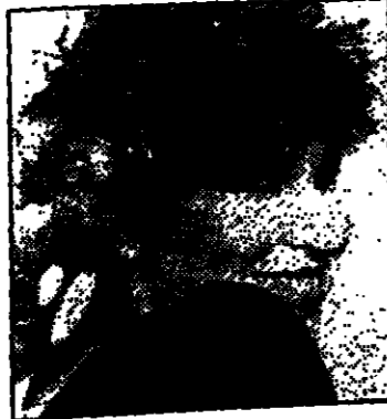
Bette Midler: Mature mama

A POLISH National Day celebration was hosted at the